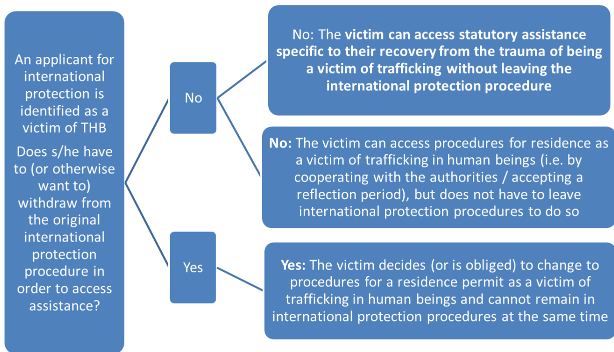
Figure 8.1: flow chart illustrating the possibilities for referral to assistance for victims in international protection procedures