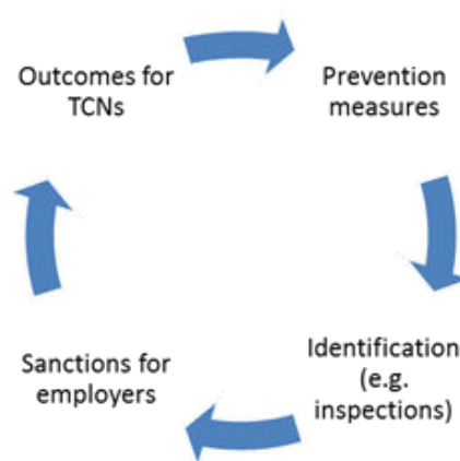
Figure 2: Illegal employment policy cycle

Figure 2 below depicts the different steps of illegal employment policy as a cycle. Firstly, the prevention measures and incentives for both employers and employees are depicted as a first step in the policy cycle. This is followed by identification of illegal employment through inspections and other measures which in turn leads to sanctions for employers and different outcomes for migrants (such as return to the country of origin or regularisation of stay and employment). It is recognised that the various steps do not necessarily follow chronologically from each other; however, the notion of a cycle is used in the Study for organisational purposes, as it helps to highlight the different aspects which the analysis will focus on.