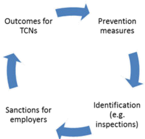
Figure 1: Illegal employment policy cycle