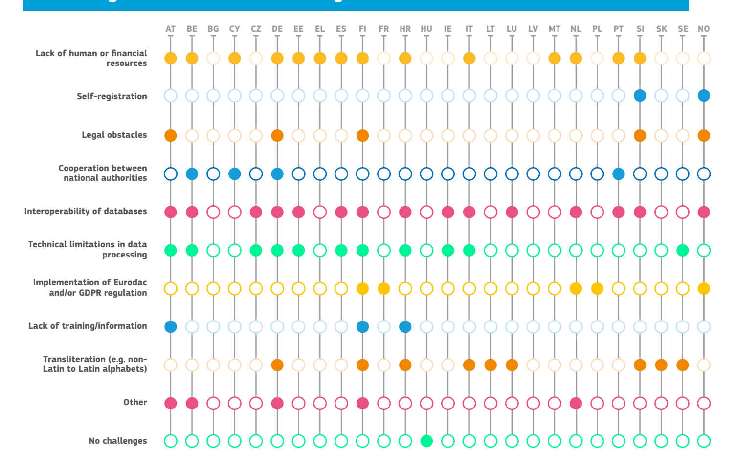
Figure 2. Overview of challenges

Some of these challenges are ongoing in 14 Member States and in Norway, with several others exploring different solutions.<sup>24</sup>